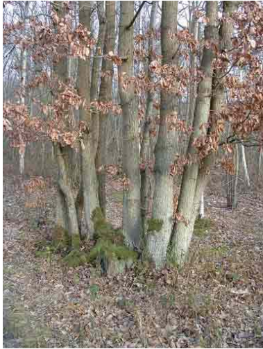
Oak coppice singled

alternative. Oak was the wheelwright's choice for spokes, elm for the hub and ash for the rim. Stephenson's Rocket had oak driving wheels! Even oak galls had their use. Gallic and tannic acids derived from oak apples were mixed with ferrous sulphate to make a good ink. Moreover the ferrous sulphate was sourced locally from the Copperas industry based in Whitstable.